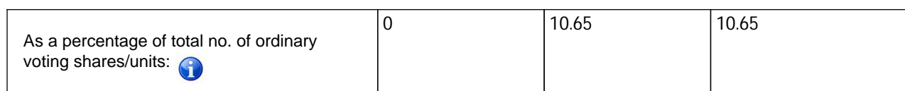
Table 3. Change in respect of rights/options/warrants over shares/units of Listed Issuer